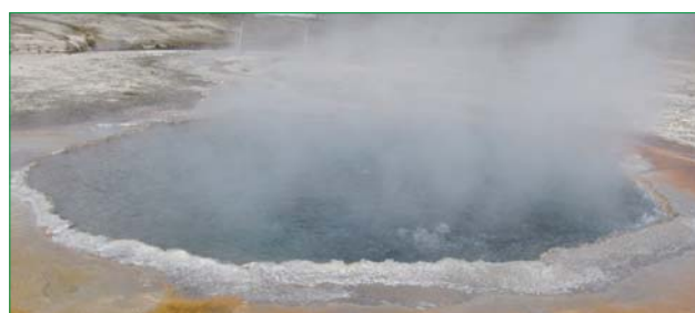
耐熱性芽孢杆菌精氨酸酶(BCA)生長在極高溫的泉水內 Thermotable Bacillus arginase (BCA) can be isolated from a hot spring bacterium

Arginine deprivation has become a new cancer treatment paradigm and has exploited for treatment of various cancers. Arginine is an essential amino acid for the growth of cancer cells. Deprivation of arginine induces cancer cells death but it is generally well tolerated in normal cells. The successful use of Arginine Deiminase (ADI) to treat argininosuccinate synthetase (ASS)-deficient tumors has opened up new possibilities for targeted therapy. Nevertheless, many ASS-positive cancers are resistance to ADI.